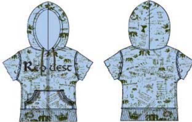
R11188G LIGHT BLUE